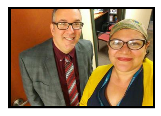
Even our federation staff joins in for Maccabiah!